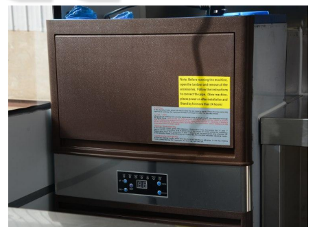
- Ice Maker -