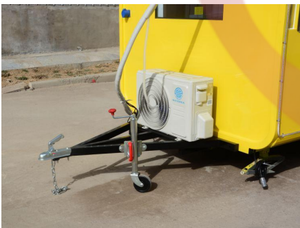
- Tow Bar -