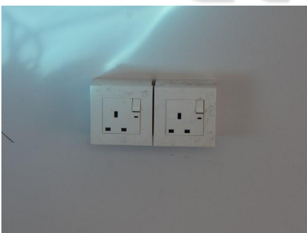
- Outlets -