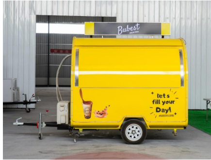
- Trailer with LOGO Wrap -