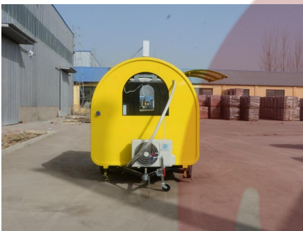
- Air Conditioner -