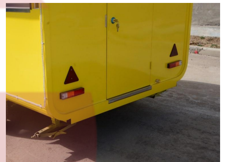
- Tail Lights -