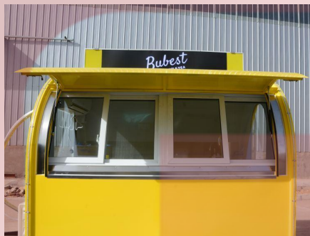
- Window -