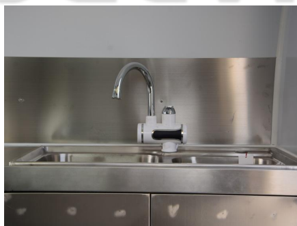
- Sinks -